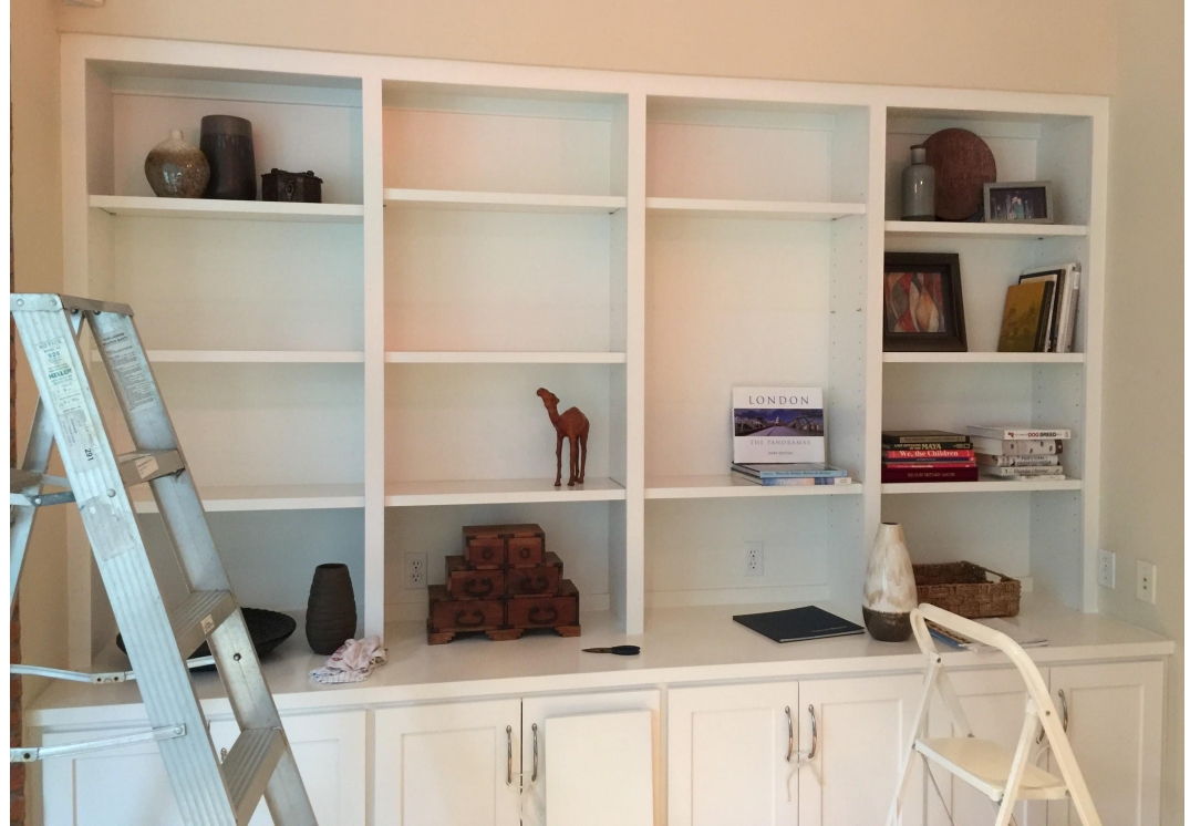
Photo of a bookshelf styling in progress

Sometimes there are just too many bookshelves to fill! Reduce the number by removing a shelf and adjusting the rest, if you have adjustable shelves. Not only can you add taller objects, but items feel like they can now breathe and won't feel so cluttered.